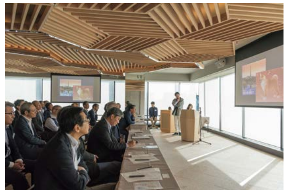
The "1st JFR Creation Award" presentation at Ginza Six

Beginning in fiscal year 2018, the contents of the "Challenge Card" have been divided into three categories including "sales measures," "operational improvement" and "new business" and the ideas for new businesses are examined at the Company. The event named the "Creation Award" is held semiannually at each company and each store and the Group-wide "JFR Group Creation Award" is held annually.