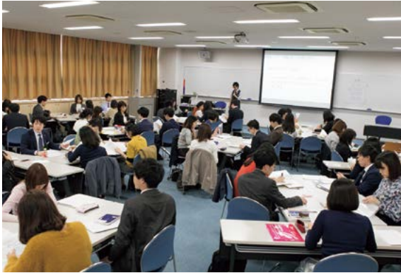
Training at JFR three-year training school for new employees with college degrees (JES)* *JES stands for JFR Entry School.

We thoroughly develop and strengthen employees' "personal basic skills" required for leaders with a focus on their first three-year career at the JFR three-year training school for new employees with college degrees (JES). We provide a "career development training" to employees aged 27 where employees review their experiences from the past to the present for future career development.