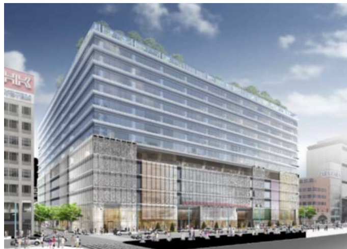
Exterior view from “Chuo Dori”

By leveraging the expertise and network of the four partners, the powerful partnership will bring out the best in Ginza, a town synonymous with the best of Japanese retail. The consortium will work together to generate buzz by attracting visitors from all around the world to this unprecedented world-class retail facility.